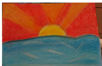
By Saskia B