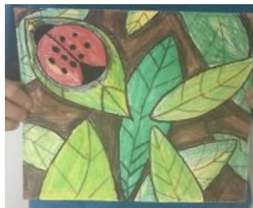
By Brodie C